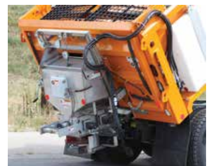
Salt Slurry Generator