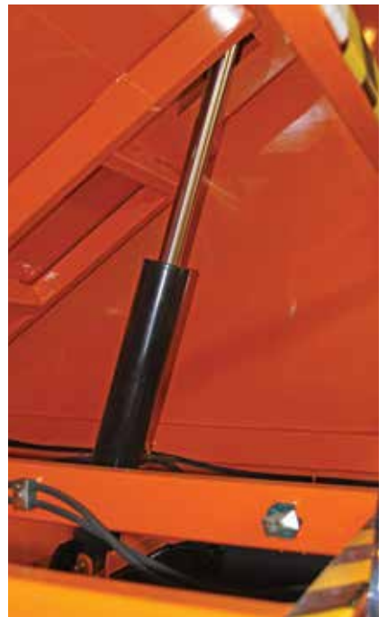
4" Tilt Cylinder