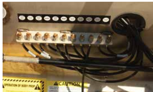
Remote Mounted Grease Extension with Each Grease Point Clearly Labeled. Available for Front and Rear