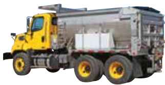
Spreader | RDS