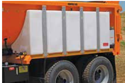
Fender Mounted Pre-Wet Tanks