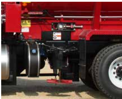
Side Spinner w/ Drop Chute