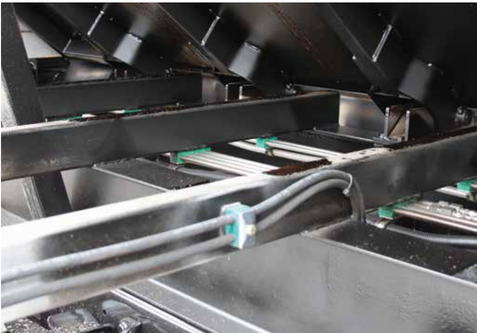
Bolt-On Hinges with Stainless Steel Pins