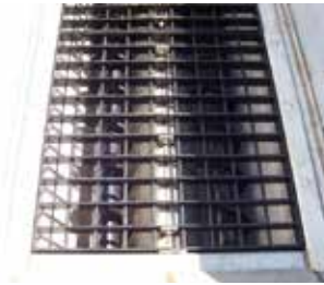
Dual Auger with Bottom Screens