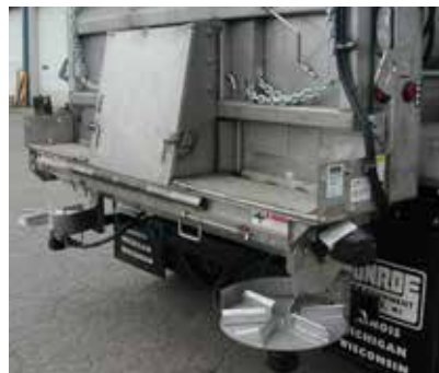
Tailgate Spreader with Dual Discharge