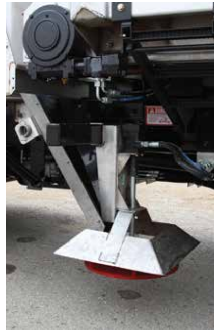
Adjustable Spinner/Berm Chute