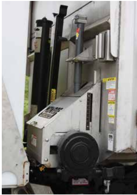
25:1 Drive System & Screw Adjustable Gate