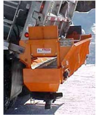
Rear Cross Conveyor