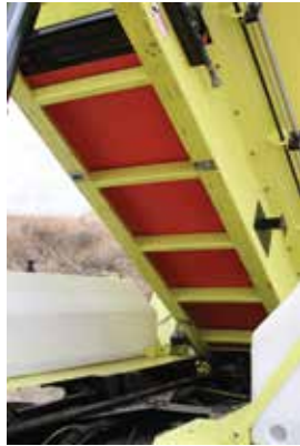
3/8" Poly Sub Floor Kit