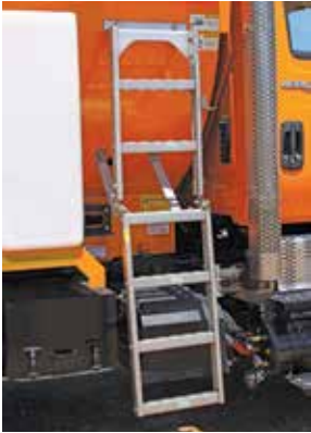
Fold Up Ladder