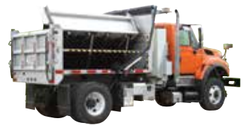
Spreader | DTS