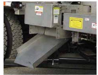
Optional Folding Berm Chute for Front Cross Conveyor