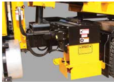
Front Cross Conveyor with Two Ply High-Temp Rubber Belting and Front Mounted Spinner