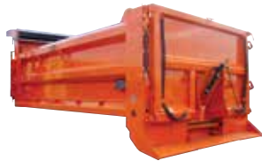
Spreader | FFDS