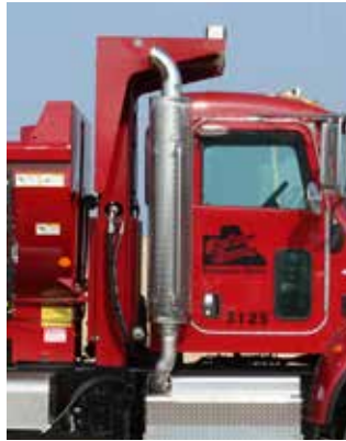
Stand Alone Cabshield