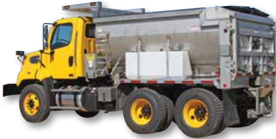
Corrosion Resistant Stainless Steel