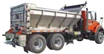
Spreader | DVS